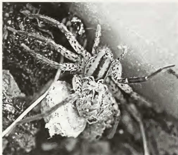
Fig. 3: Behaviour of Pardosa amen-tata spiderlings on substitute Hygrolycosa rubrofasciata mother. Most of the spiderlings were not successful in settling on the opisthosoma of a substitute female. Instead, they formed a cluster beside the empty cocoon. The female was carrying both the spiderling cluster and the empty cocoon for a while, until she lost the cluster.

A generally accepted statement that females of all wolf spiders carry spiderlings on their opisthosomas was contested. Fujii (1976) was the first author to report "abnormal" behaviour in two Arctosa species which carried spiderlings on their cocoons instead of on their opisthosomas. Suwa (in litt. 1977) and Yaginuma (1991) reported similar behaviour for Hygrolycosa umidicola , and Kronestedt (1984) and Ahtiainen et al. (2002) suggested such a possibility in Hygrolycosa rubrofasciata too. In the present study, it was confirmed unequivocally that females of H. rubrofasciata do not carry spiderlings on their opisthosomas, but instead on their empty cocoons. Until now, this